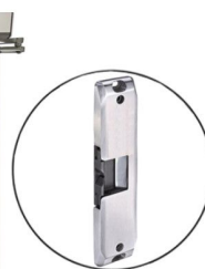
ELECTRIC STRIKE FOR RIM EXIT DEVICES